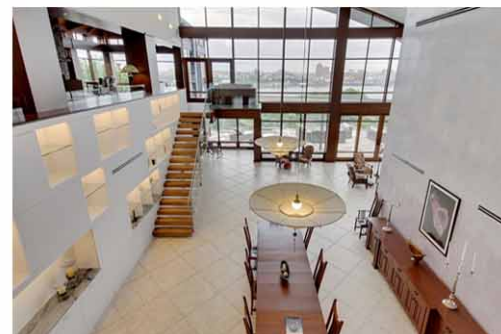
Grand Room - 27' Ceilings