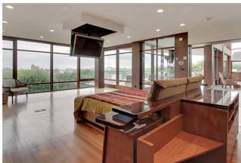
Master Bedroom w/Views